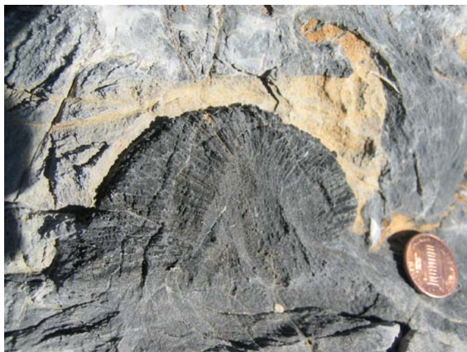
Seafloor precipitate from the Triassic Union Wash Formation, Darwin Hills, CA; photo courtesy of Adam Woods.

An excellent program has been assembled, of which PS-SEPM is sponsor or co-sponsor of five technical sessions and four field trips .