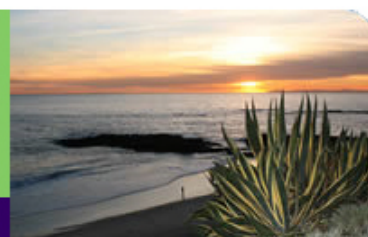
Orange County coastal sunset

Registration Sessions Trips Courses Events/Exhibits Students Lodging Contact Home