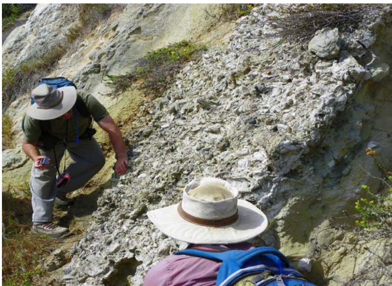
Impressive oyster coquina within Vaqueros Formation, Near Point Beach sea cliffs exposure.

Field Day 2: Saturday, Sept 19 , participants visited Posa Canyon to view the Paleocene through Miocene stratigraphy in the southwest part of the island. Spectacular Paleocene turritella beds (above) were observed, and a wildcat well drilled by ARCO in the 1950s which penetrated into and verified the presence of Upper Cretaceous forearc basin strata. Coarse-grained facies of the Vaqueros and San Onofre Breccia in upper Posa Canyon were observed. A visit to the beautiful (and empty!) Near Point beach followed, for lunch, body surfing and examination of the lower through Middle Miocene Vaqueros, Rincon, San Onofre Breccia, and Beechers Bay (Blanca) Formations. Engaging discussions were held regarding the various clast suites and potential sediment paleodispersal systems within the context of the rotated Transverse ranges, and thankfully Dr. Tanya Atwater was present along with her famous “Tanya-gram” depicting the rotation event, to keep us all focused on the big picture!