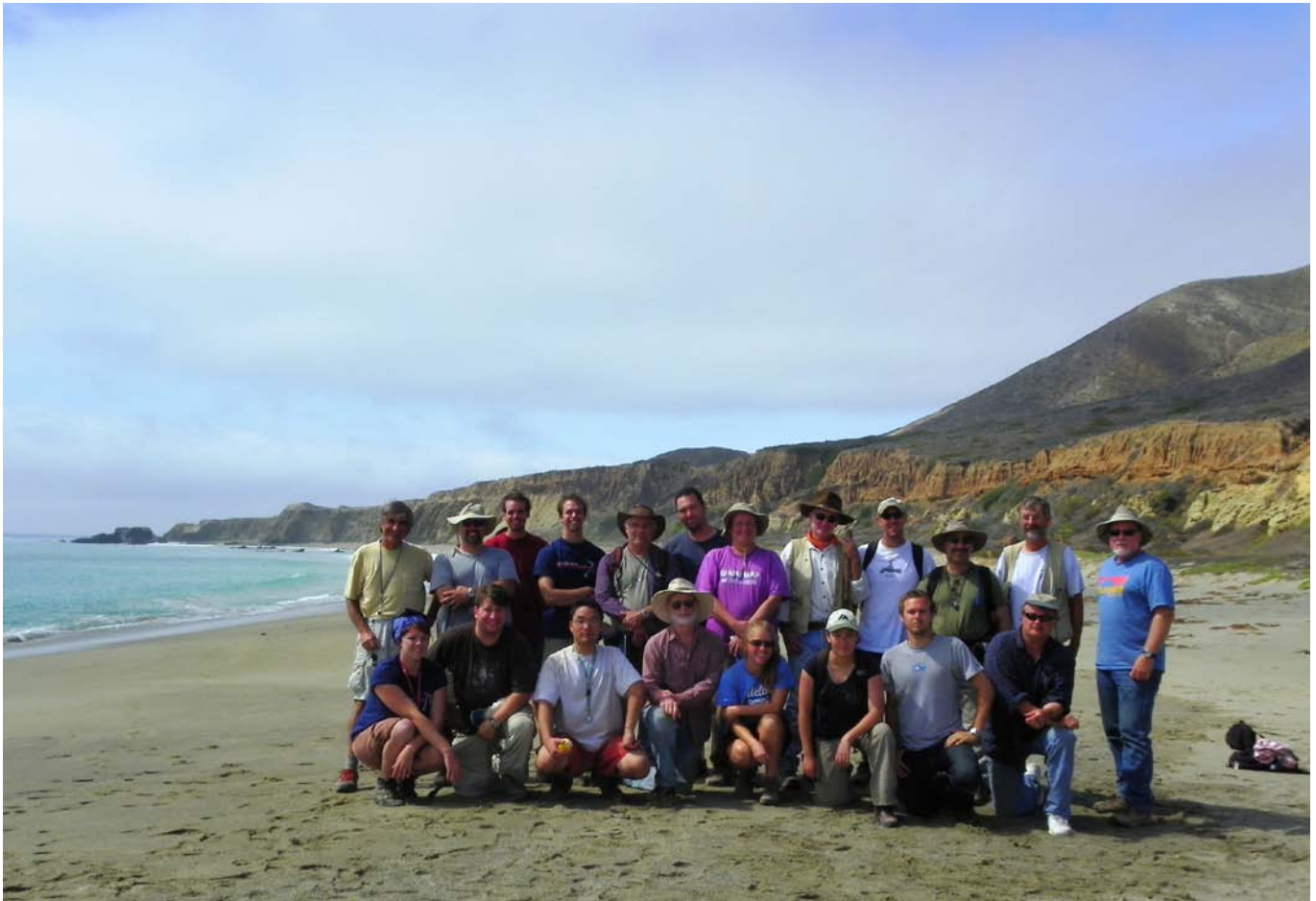
Happy FT participants at Near Point Beach, SW coastline of island, Sunday Sept. 19, 2009, following lunch & body-surfing; Lower to Middle Miocene sequence exposed in sea cliffs in background.

Twenty-two PS-SEPM members, including several students, participated in the outstanding fall field trip to Santa Cruz Island on September 2009, led by Emeritus Professor Dr. Jim Boles of UC Santa Barbara. The trip examined spectacular sedimentary geology, thick middle Miocene volcanic sequences and active faulting features in the remote western half of the island, which is not accessible to the general public. Participants enjoyed perfect fall weather and up-close views of marine wildlife (blue whales!) on the charter boat trip over to the island, and comfortable accommodations & terrific meals at the UC Natural Reserve System facility.