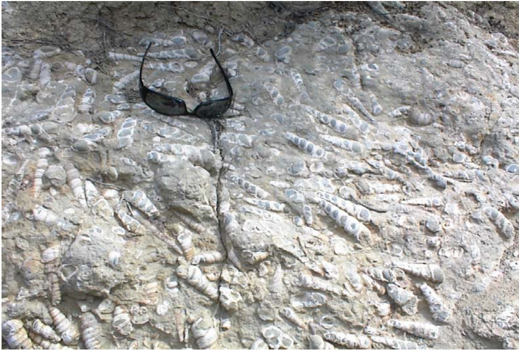
Spectacular assemblage of Turritella pachecoensis in Paleocene Pozo Formation.

Field Day 2: Saturday, Sept 19 , participants visited Posa Canyon to view the Paleocene through Miocene stratigraphy in the southwest part of the island. Spectacular Paleocene turritella beds (above) were observed, and a wildcat well drilled by ARCO in the 1950s which penetrated into and verified the presence of Upper Cretaceous forearc basin strata. Coarse-grained facies of the Vaqueros and San Onofre Breccia in upper Posa Canyon were observed. A visit to the beautiful (and empty!) Near Point beach followed, for lunch, body surfing and examination of the lower through Middle Miocene Vaqueros, Rincon, San Onofre Breccia, and Beechers Bay (Blanca) Formations. Engaging discussions were held regarding the various clast suites and potential sediment paleodispersal systems within the context of the rotated Transverse ranges, and thankfully Dr. Tanya Atwater was present along with her famous “Tanya-gram” depicting the rotation event, to keep us all focused on the big picture!