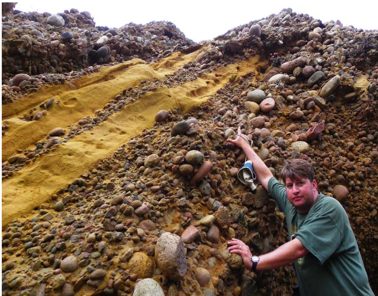
Lower Sauces Canyon, West Santa Cruz Island. Spectacular deep marine conglomerate & sandstone of Middle Eocene Jolla Viejo Formation, displaying imbricated clasts of granitics and meta-porphyry, correlated with Poway and/or Las Palmas conglomerates of the San Diego – Northern Baja area. From PS-SEPM fall field trip, Santa Cruz Island, 2009; Photo courtesy of W. Henderson (who also graciously provided scale).